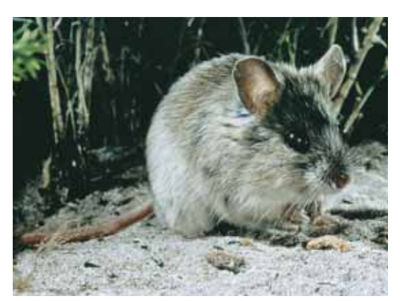
Shark Bay mouse