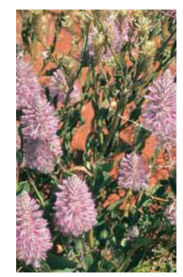
Tall mulla mulla

The released animals will be fitted with small radio transmitters and monitored continuously for at least the first three months after they are released. Radio-tracking, together with an ongoing trapping program, will provide valuable information about their survivorship, breeding, home range, dispersal, diet and habitat utilisation and population dynamics. The sandy roads and tracks in the release area will also be used to monitor animal activity.