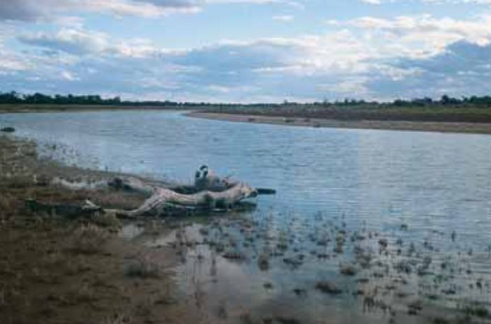
Sydney Heads Pass, Earaheedy