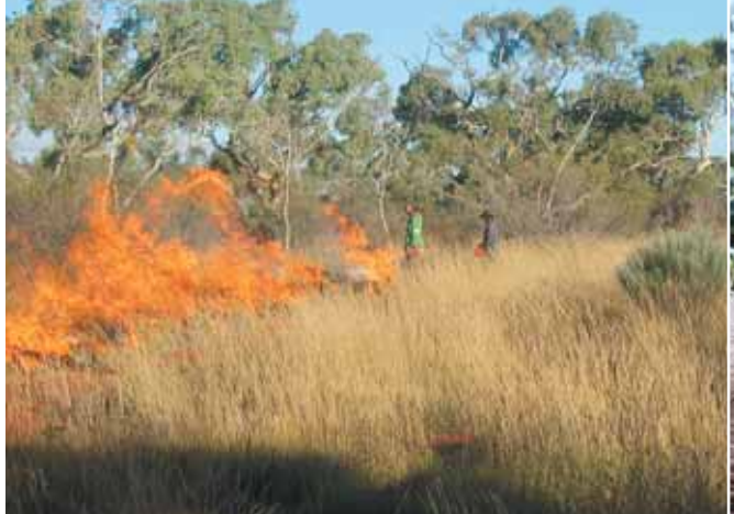
Traditional owners burning at Lorna Glen

The Operation Rangelands Restoration project was initiated by DEC, through a project team that includes staff from its Goldfields Region (Kalgoorlie), Science Division and Nature Conservation Division. The Wiluna traditional owners, who are excited by the prospect of the return of native mammals, are involved through a joint management MoU with DEC. In addition, the project has attracted the involvement of students and academics from local and international universities. Perth Zoo will breed some of the animals to be reintroduced.