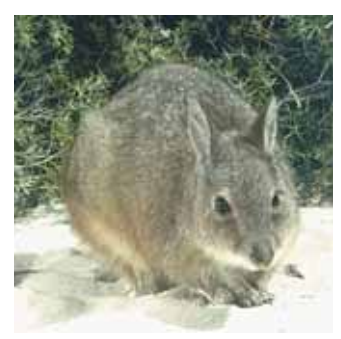
Rufous hare wallaby

Bilbies, western barred bandicoots and mala will be sourced from DEC's captive breeding programs at the Dryandra Captive Breeding Facility and the Peron Captive Breeding Centre. Brushtail possums will be sourced from healthy extant wild populations in the Wheatbelt. Boodies, golden bandicoots and Shark Bay mice will be sourced from healthy populations on off-shore islands. Chuditch, pale field rats and red-tailed phascogales will be captive bred at Perth Zoo.