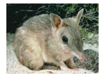
Western barred bandicoot

A considerable amount of preparation, planning and ground work has been undertaken in the project area during the past four years. An intensive level of activity will occur over the next two to three years (2007-2009) associated with Stage 1 of the mammal reintroductions (reintroduction of bilbies and brushtail possums). Following the success of Stage 1, reintroduction of another nine arid zone mammals is scheduled over the period 2009-2020. Introduced predator and herbivore control, fire management and monitoring will be on-going.